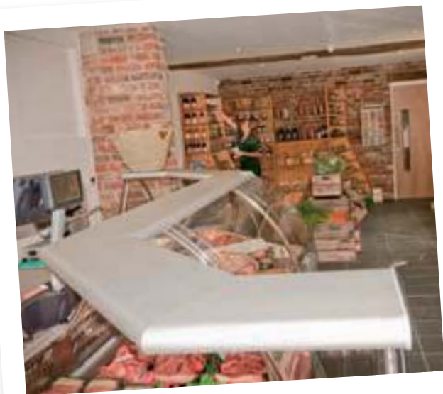
The Fordhall Farm Shop

wool insulation and natural clay paints. The building now holds our office, classrooms, tearoom, restaurant, function rooms, farm shop and butchery. The ability for the FCI to generate its own income is now in full swing.