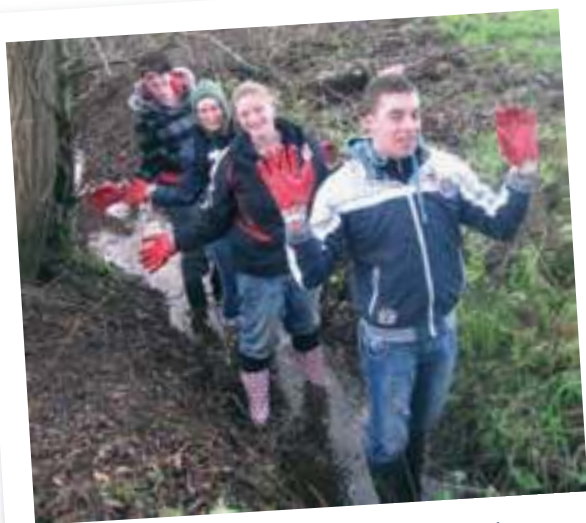
Volunteers at Fordhall

A community-owned farm never stands still, you will never stop learning and the challenges will keep coming – enjoy it.