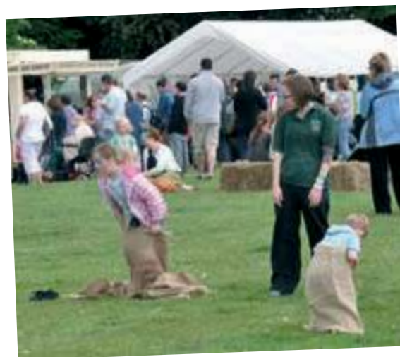
Fordhall summer school

Our next focus went on organising community events on the farm. These varied from story-telling days, to farmers' markets, summer fairs, guided tours and art days. Literally anything we could think of that would encourage our local community to visit and enjoy their time at Fordhall.