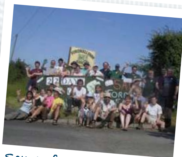
Some of our brilliant volunteers