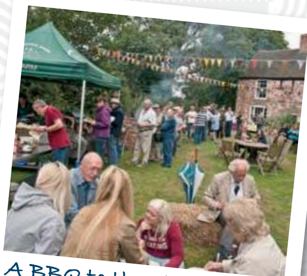
A BBQ to thank our supporters

Success for your community-owned farm will be secured by revisiting your vision on a regular basis and reacting to the needs of your community; ensuring your project remains interesting, diverse, and active. If you can do this you will continue to gain new supporters and you will maintain the interest of your longstanding supporters.