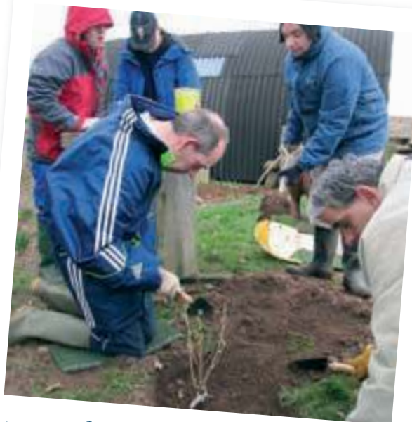
Wayfarers planting fruit