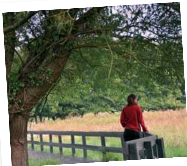
Fordhall morning boardwalk