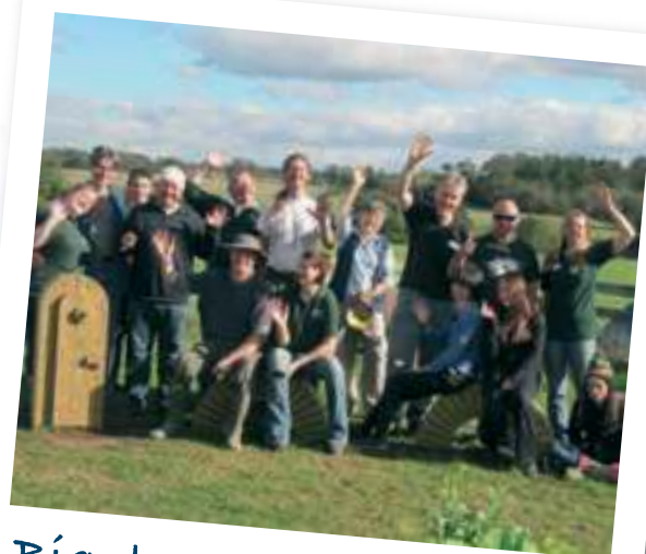
Big draw and working weekend

(b) To ensure farmland is managed sustainably for community benefit with the appropriate management for access, and to research sustainable farming through community land trusteeship, public involvement and other methods.