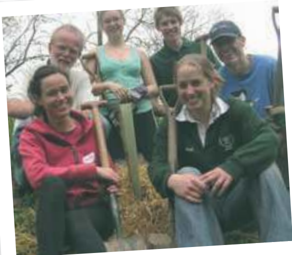
volunteer tree planting weekend

When we began our fundraising in December 2005 for Fordhall, we had only six months to raise £800,000. At the time we were unaware of the support we may get for our campaign. But as soon as word got out, it seemed to touch a nerve with the general public and the response was overwhelming. We remained positive throughout and we always tried to have fun.