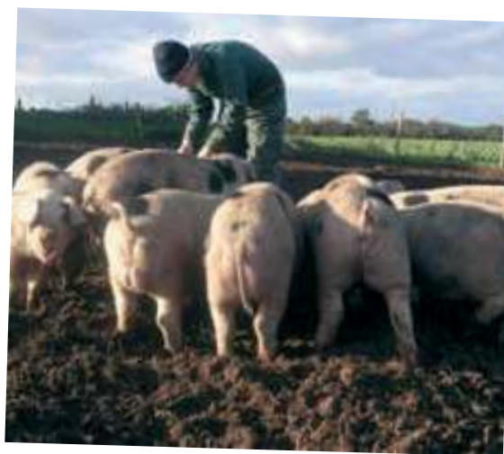
Adam feeding the pigs whilst on work experience

Land values will influence your choice to buy or rent your community farm. But remember, although the land may be expensive for you to buy now, if you are tenants there will always be the chance that the land will be sold to someone else in the future; possibly for housing or industrial development. If you choose to rent land you need to be happy with the level of long term security that it gives your project and your community.