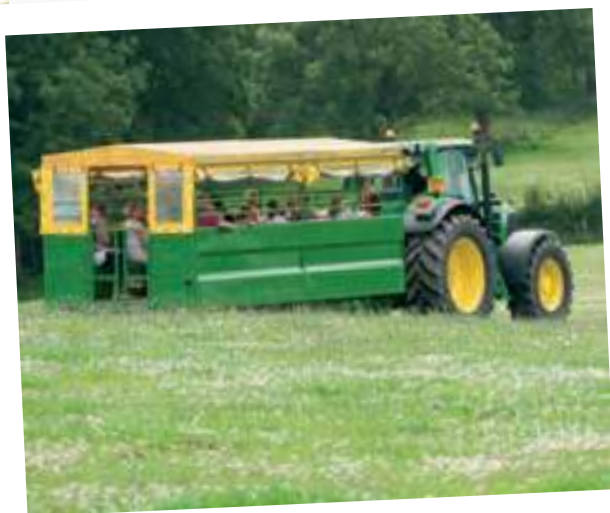
A trip round Fordhall