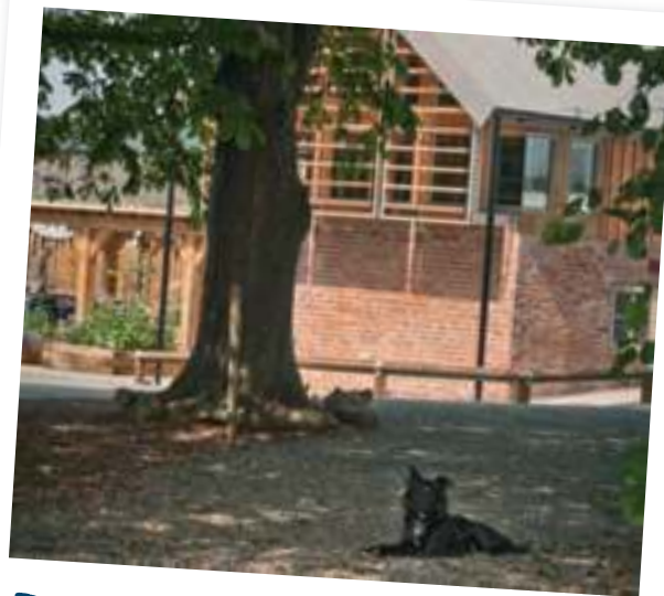
Poppy through the trees