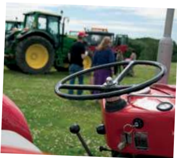
Tractors provide a great attraction for children on farm open days

When Fordhall Organic Farm was saved from development in 2006, we certainly felt the pressure: 8,000 members of our community, both local and further afield, had invested in this farm for the future. They had bought into a vision for the future of farming, and now we had to live up to that vision. We had changed one landlord for 8,000 community landlords.