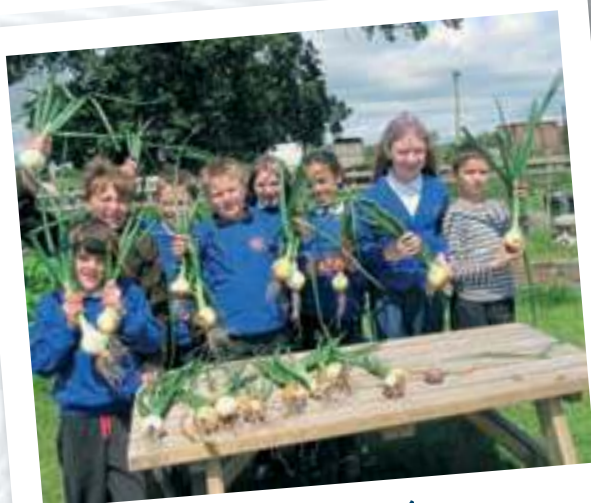
Growing onions in our community garden

The Fordhall community-owned farm engages a 'community of interest' whilst providing land, a house and buildings for a young farmer to rent. Our motivation at Fordhall was to safeguard the land from industrial development and to create a place that reignited the relationship between people, their food and the land it comes from. We wanted to create a place that was educational, brought farm and community together, and created long term security for tenant farmers - a rarity in today's agricultural industry.