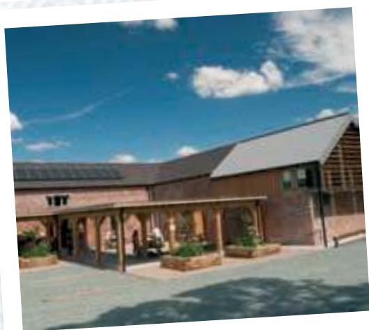
Fordhall June 2011

Fundraising for specific capital projects will continue, but funding to cover our core costs will be generated through enterprise. In 2010 we began our plan to renovate the Old Dairy building. 12 months later and it was open to the public. A sustainably renovated barn complete with Photo Voltaic (PV) panels, a green roof, air source heat pump, hemp walls, sheep's