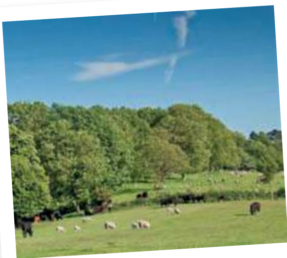
A sunny day at Fordhall

The motivation you have for placing land into community-ownership may vary. Generally it becomes an option when the conventional systems fail to work and the land is placed in jeopardy.