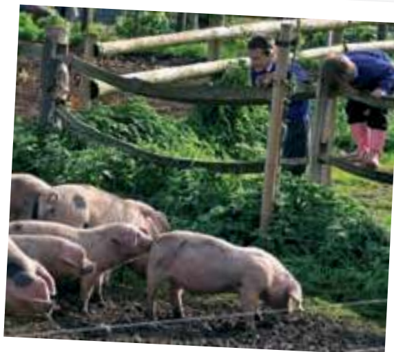
Fordhall farm trail

Everyone likes a feel good story and they will tell others, especially if they feel like they can make a difference. What's your story?